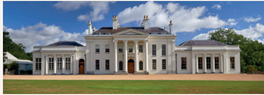
Hylands House, ESSEX Wednesday 30 th April