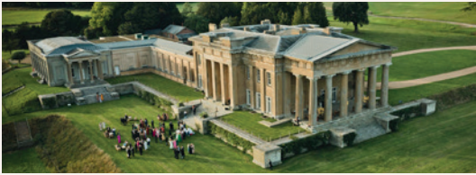
The Grange Hampshire, HAMPSHIRE Tuesday 29 th April