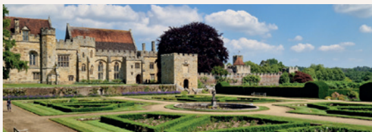
Penshurst Place, KENT Wednesday 14 th May