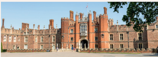
Hampton Court Palace, SURREY Tuesday 13 th May